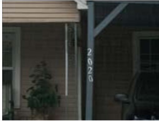
Address Verification Photo