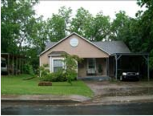
Subject Front Photo