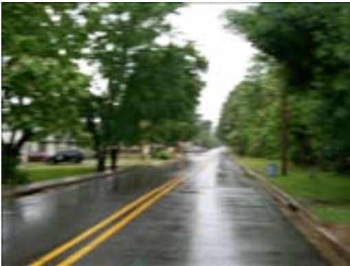
Street Scene Left Photo